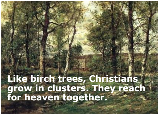
Like birch trees, Christians grow in clusters. They reach for heaven together.

Where will you be on the Sunday, June 8th? How about joining us as we together celebrate the birthday of the church. How about gathering with all of the members of ALC on that special day, wearing red - the color of Pentecost, and raising your voices in hymns of thanksgiving for the gift of the Spirit. How about coming together as God's people and remembering your baptism, your spiritual birthday. How about gathering together to recall how the Spirit of God moved through the apostles, giving them a voice to share words about God's love and hope that we continue to hear and follow today.